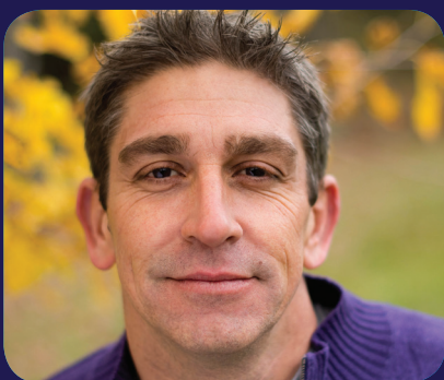
Ware Lecturer Richard Blanco

Selected by President Obama as the fifth inaugural poet in U.S. history, Richard Blanco is the youngest and the first Latino, immigrant, and gay person to serve in such a role.